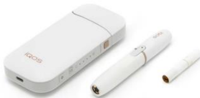
Figure A-1. The IQOS Tobacco Heating System