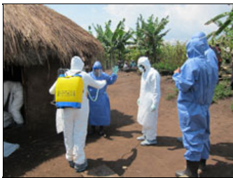
Figure 2. Healthcare Workers in Personal Protective Equipment