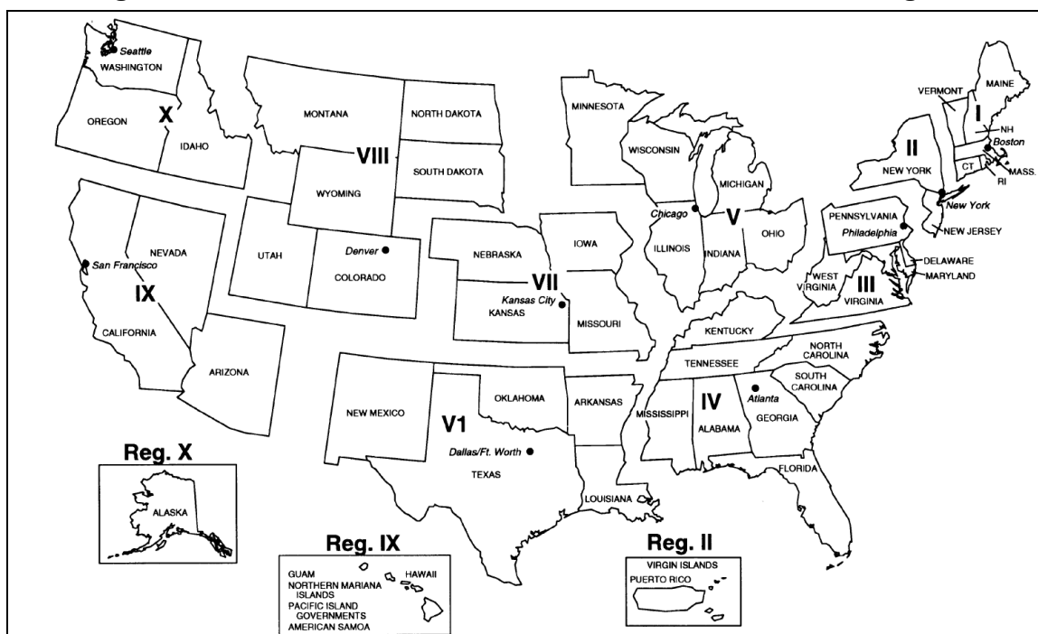
Figure 2. Standard State and Territorial Boundaries for Federal Regions