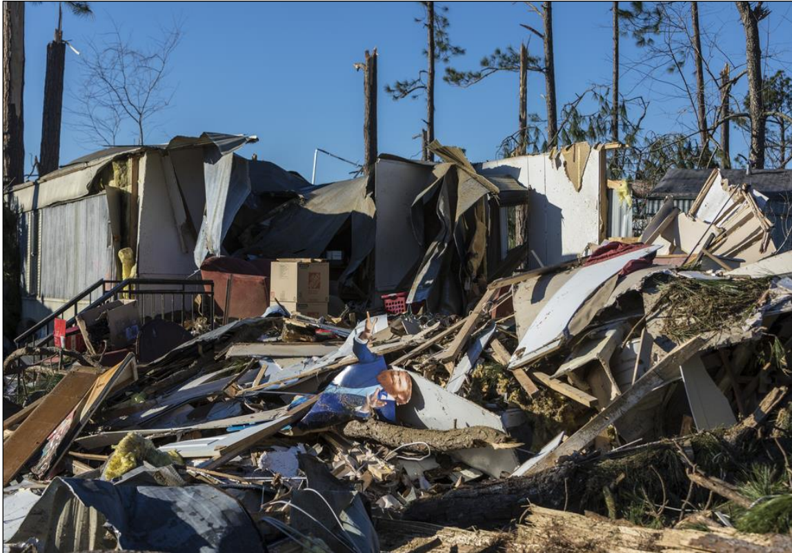
Figure 1. Mixed Disaster Debris

EPA suggests, and most states generally attempt, to remove hazardous materials such as asbestos, lead-based paint, and other contaminated materials from C&D waste before landfill disposal. 9 States may also attempt to lessen the burden on disposal facilities and potentially reduce costs by reusing and recycling C&D waste. However, if hazardous materials are mixed with C&D waste to the point that they cannot be segregated (see photo of mixed disaster debris in Figure 1 ), that waste may end up being disposed in a landfill that is not meant to safely receive such waste.