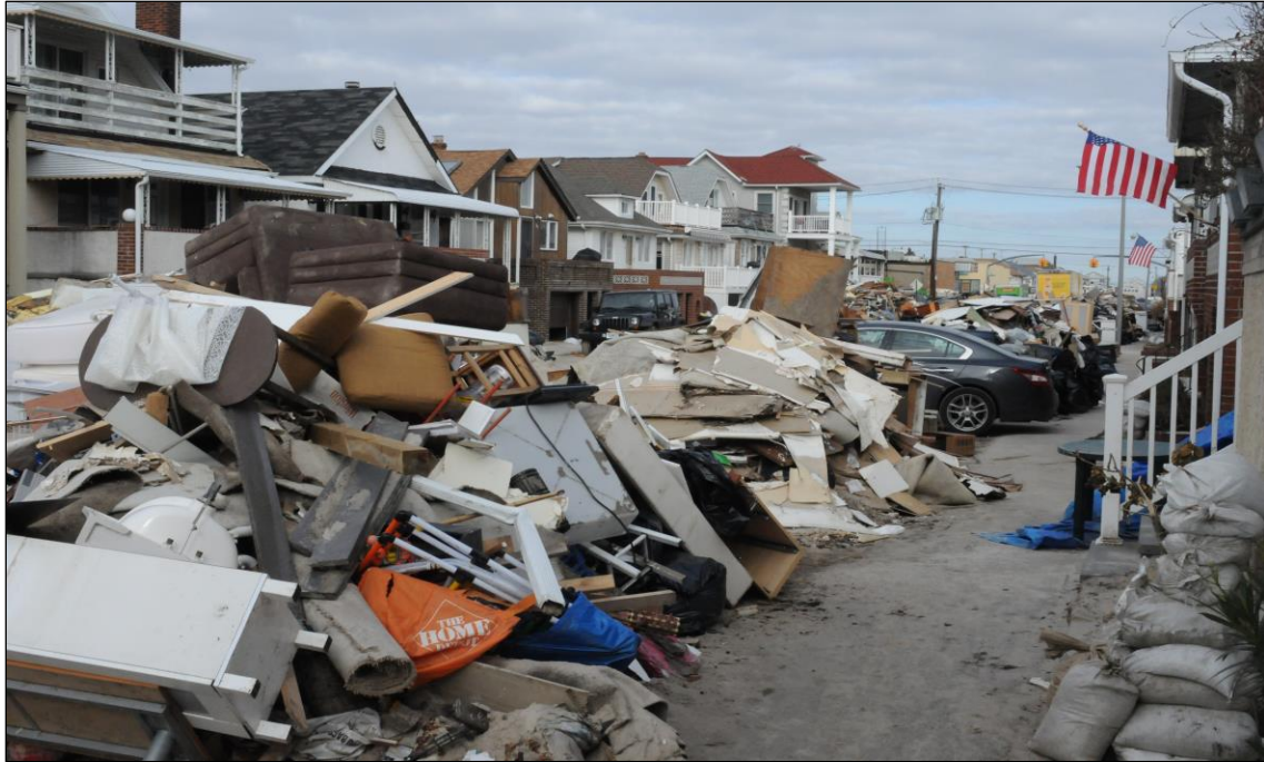
Figure 3. Waste Removal by Returning Residents