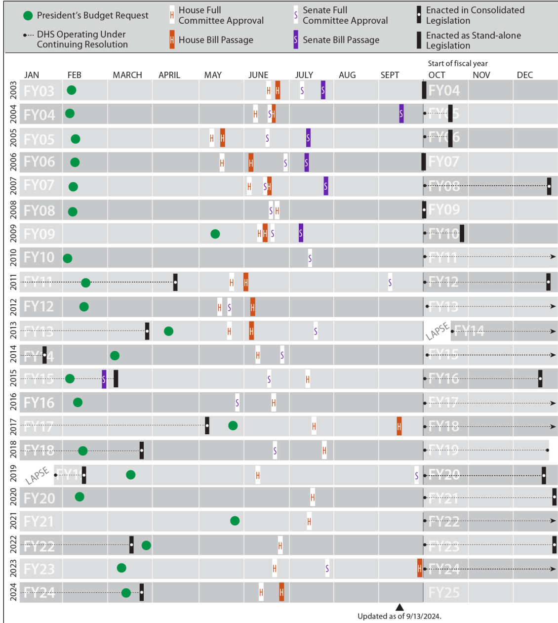
Figure 2. DHS Appropriations Process Timing, FY2004-FY2025 (As of September 13, 2024)