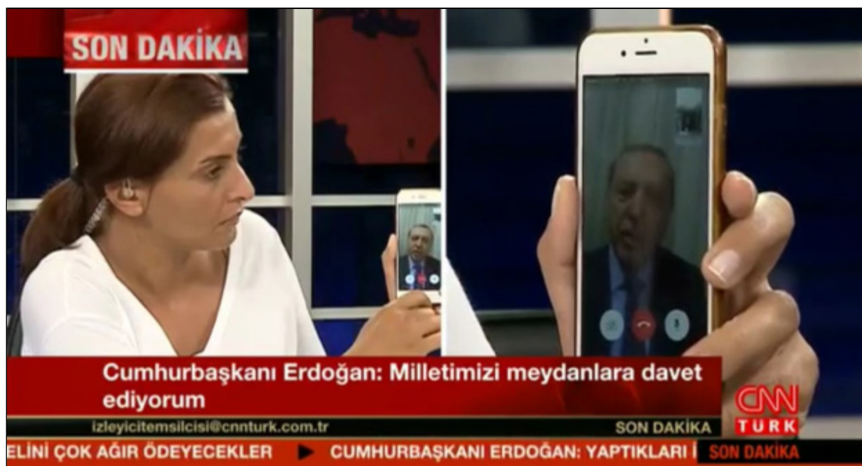
Figure 2. Key Events Surrounding Failed Coup