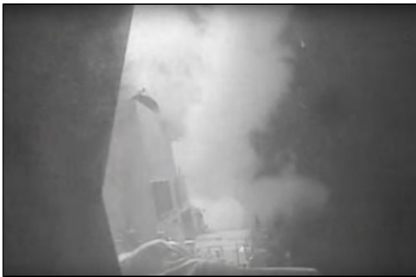
A Tomahawk Land Attack Missile Launched from USS Nitze against Houthi-Saleh radar.

Claiming self-defense, the USS Nitze fires Tomahawk cruise missiles at three Houthi-Saleh-controlled radar installations, A Pentagon spokesperson says, "These limited self-defense strikes were conducted to protect our personnel, our ships and our freedom of navigation in this important maritime passageway," Other U.S. officials reiterate that U.S. actions do not indicate deeper U.S. support for the Saudi-led coalition or deeper military involvement in the conflict.