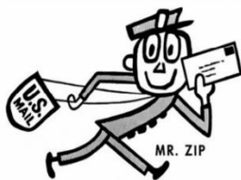
Figure 1. Mr. ZIP