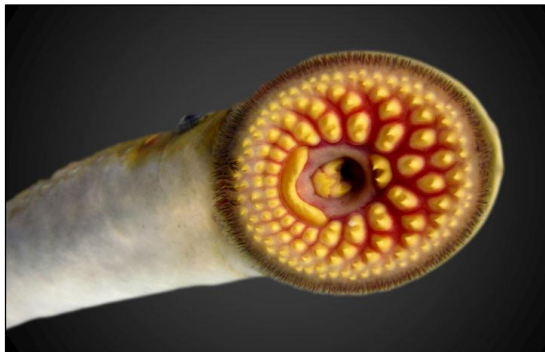
Figure 1. Sea Lamprey Mouth

The sea lamprey ( Petromyzon marinus ), sometimes known as the vampire fish ( Figure 1 ), is a parasitic fish species native to the northern Atlantic Ocean and the waters of eastern United States and western Europe. By the early 1900s, sea lampreys had spread throughout the Great Lakes, where they harm economically important fish species such as Atlantic salmon ( Salmo salar ), lake trout ( Salvelinus namaycush ), and lake sturgeon ( Acipenser fulvescens ). According to some estimates, fish wounded by sea lampreys have a mortality rate of 40%-60% and a single lamprey can kill approximately 40 pounds of fish per year. Congress is interested in efforts to control sea lamprey populations and the impacts of these efforts on the health of fisheries, recreation industries, and ecosystems of the Great Lakes and Lake Champlain. This product provides an overview of the biology and spread of sea lamprey, federal sea lamprey control programs, and selected considerations for Congress.