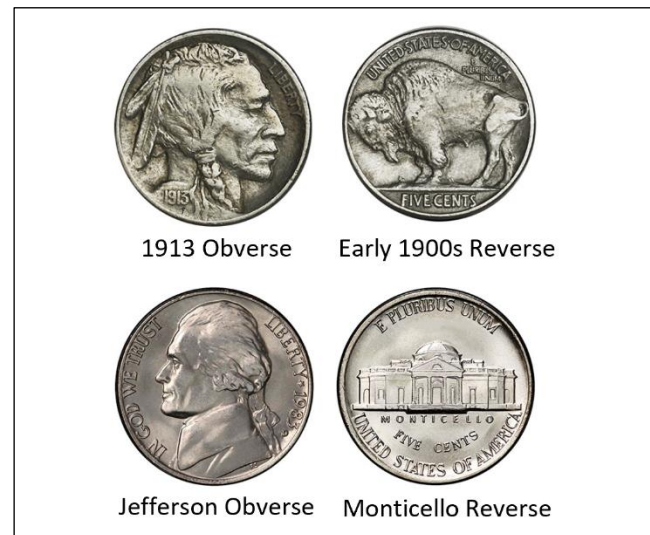
Figure 2. Selected Images of Buffalo and Jefferson/Monticello Nickels