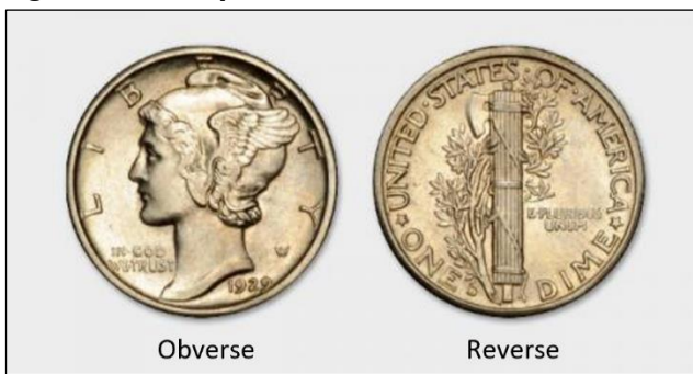
Figure 5. Mercury Dime, 1916-1945

Source: U.S. Commission of Fine Arts, "Mercury Dime," at https://www.cfa.gov/about-cfa/design-topics/coins-medals/mercury-dime .