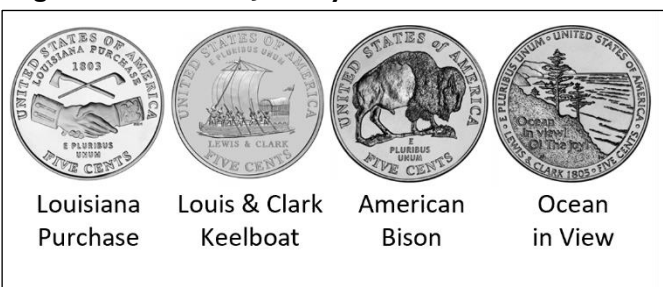
Figure 3. Westward Journey Nickel Reverse