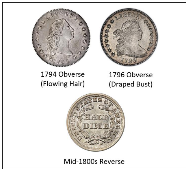
Figure 1. Selected Early American Half-Dimes