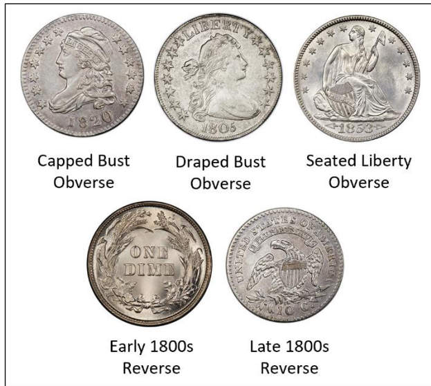
Figure 4. Early Examples of Dimes