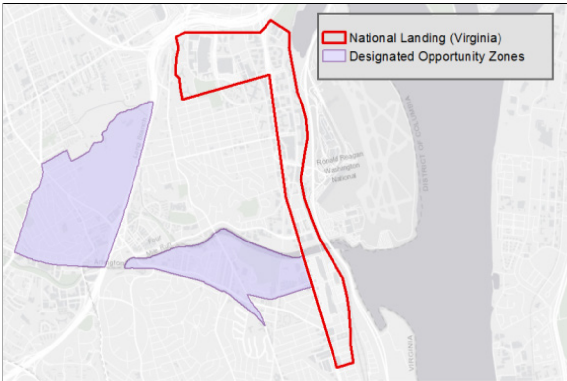
Figure 2. Designated Opportunity Zones Near Amazon Proposed HQ2 Site in Northern Virginia