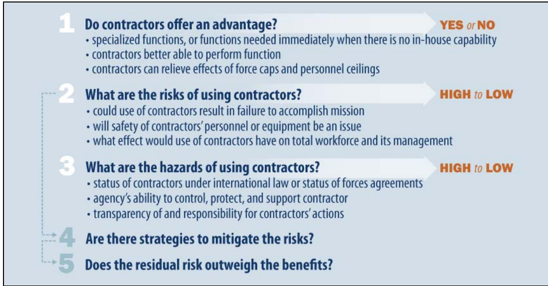
Figure 5.A Possible Framework for Addressing Questions of Contract Policy