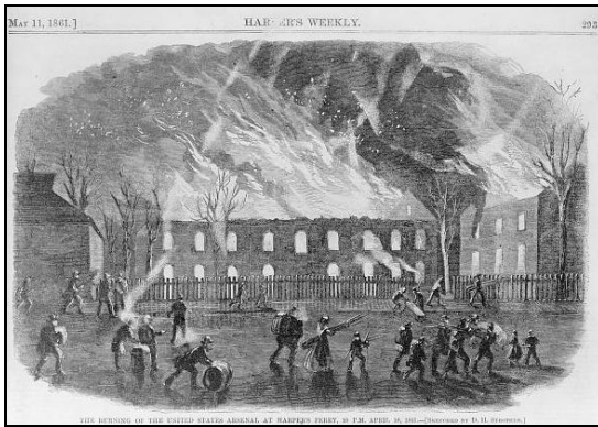
Figure 2. Burning the Arsenal at Harpers Ferry, VA, April 18, 1862