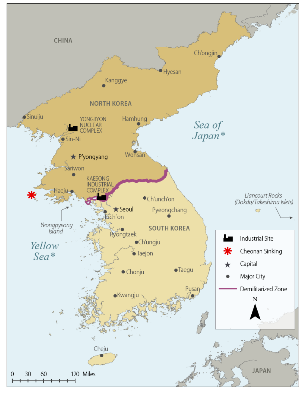
Figure 1. Map of the Korean Peninsula