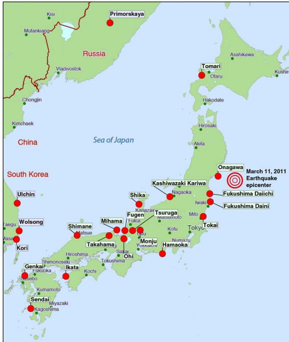
Figure 1. Japan Earthquake Epicenter and Nuclear Plant Locations