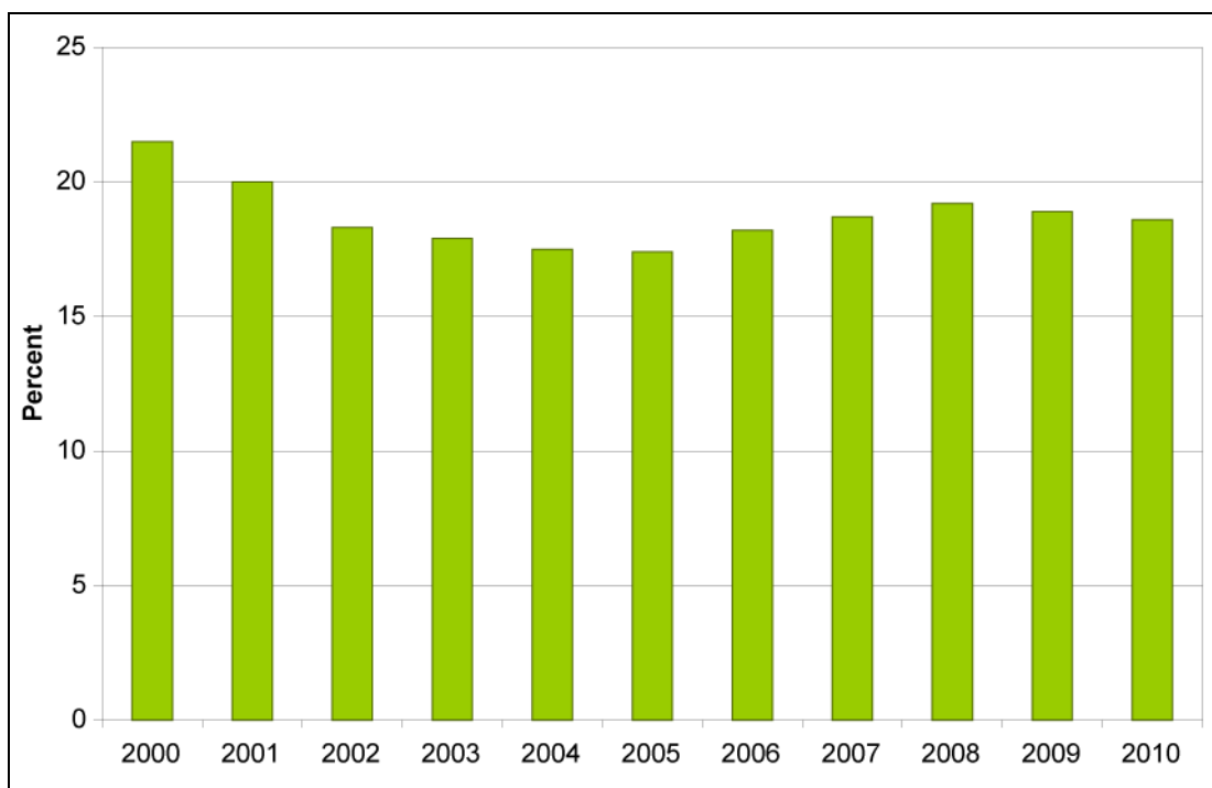
Figure 2. Germany: Fixed Investment as Percent of GDP

Note: 2009 and 2010 figures are projections.