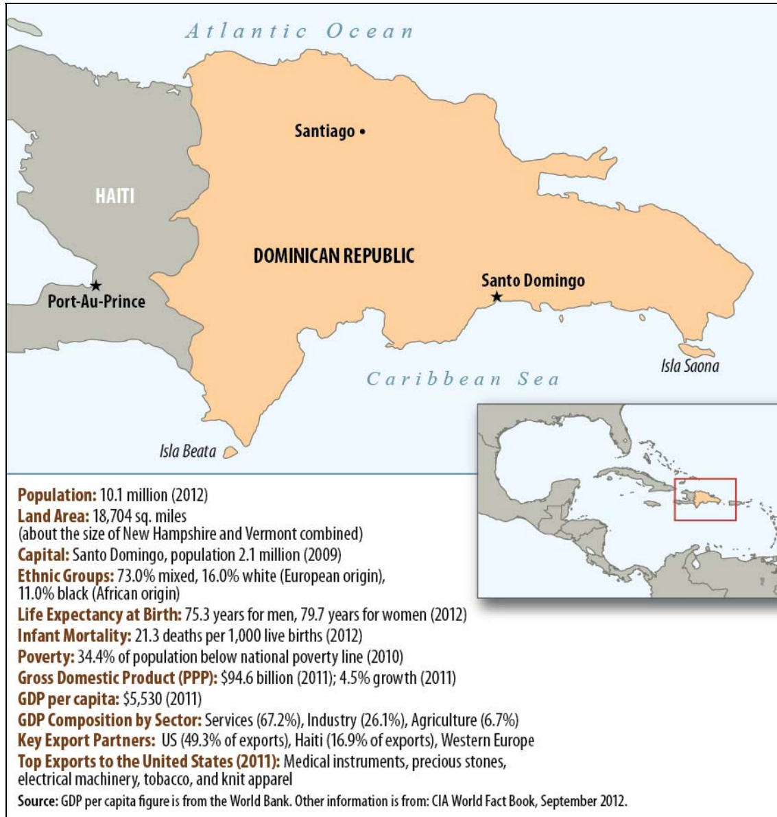
Figure 1. Map of the Dominican Republic and Haiti