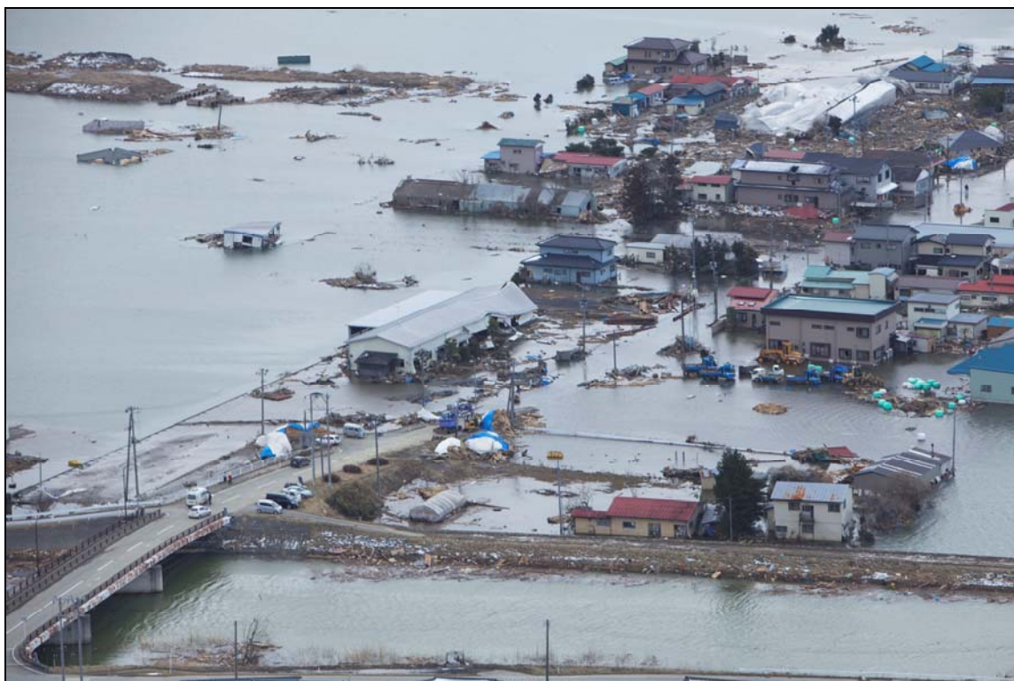
Figure 6. Aerial View of Minato, Japan, a Week After the Tsunami