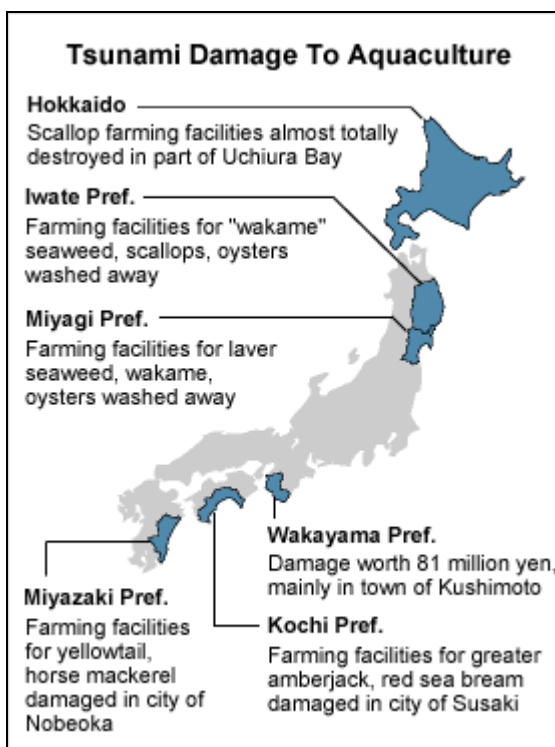
Figure 3. Tsunami Damage to Seafood Cultivation in Japan

The direct damage from Japan's earthquake and tsunami has been concentrated in the northern region of the country, some distance from Japan's industrial heartland. The financial and economic effects, however, are spreading through the Japanese economy, the East Asian region, and also may affect businesses and consumers in the United States. The effect of the record 9.0 earthquake was compounded by the ensuing tsunami that swept as far as 6 miles inland in Japan, causing widespread destruction, and that spread out across the Pacific. It caused tens of millions of dollars of damage in Hawaii, as much as $40 million in damage in California, and millions of dollars of damage primarily to harbors and boats in Oregon. As shown in Figure 3 , the tsunami also destroyed or damaged aquaculture facilities in prefectures quite distant from the epicenter. The damage, furthermore, has been compounded by the nuclear contamination from the Fukushima Daiichi Nuclear Plant plus a shortage of gasoline and of electricity that has caused rolling blackouts in Japan's industrial centers.