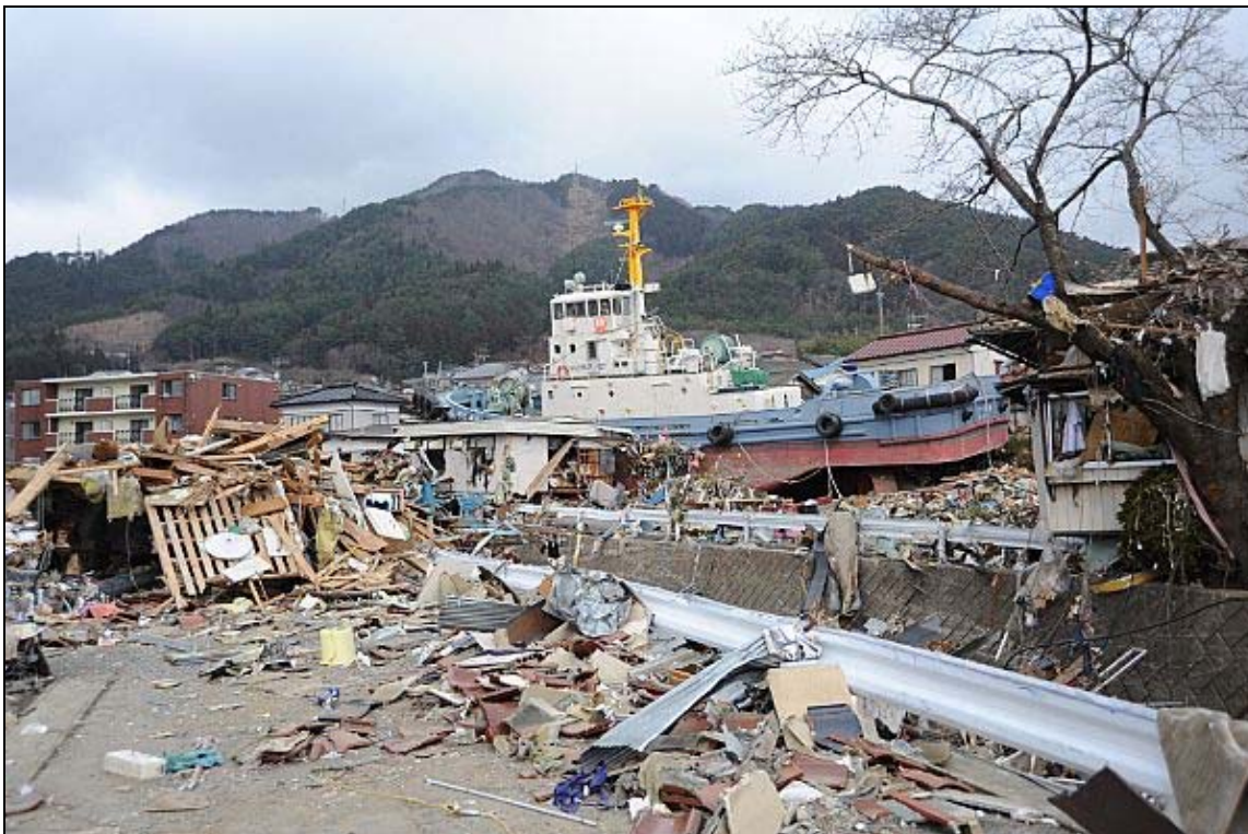
Figure 2.A Tug Boat among Debris in Ofunato, Japan