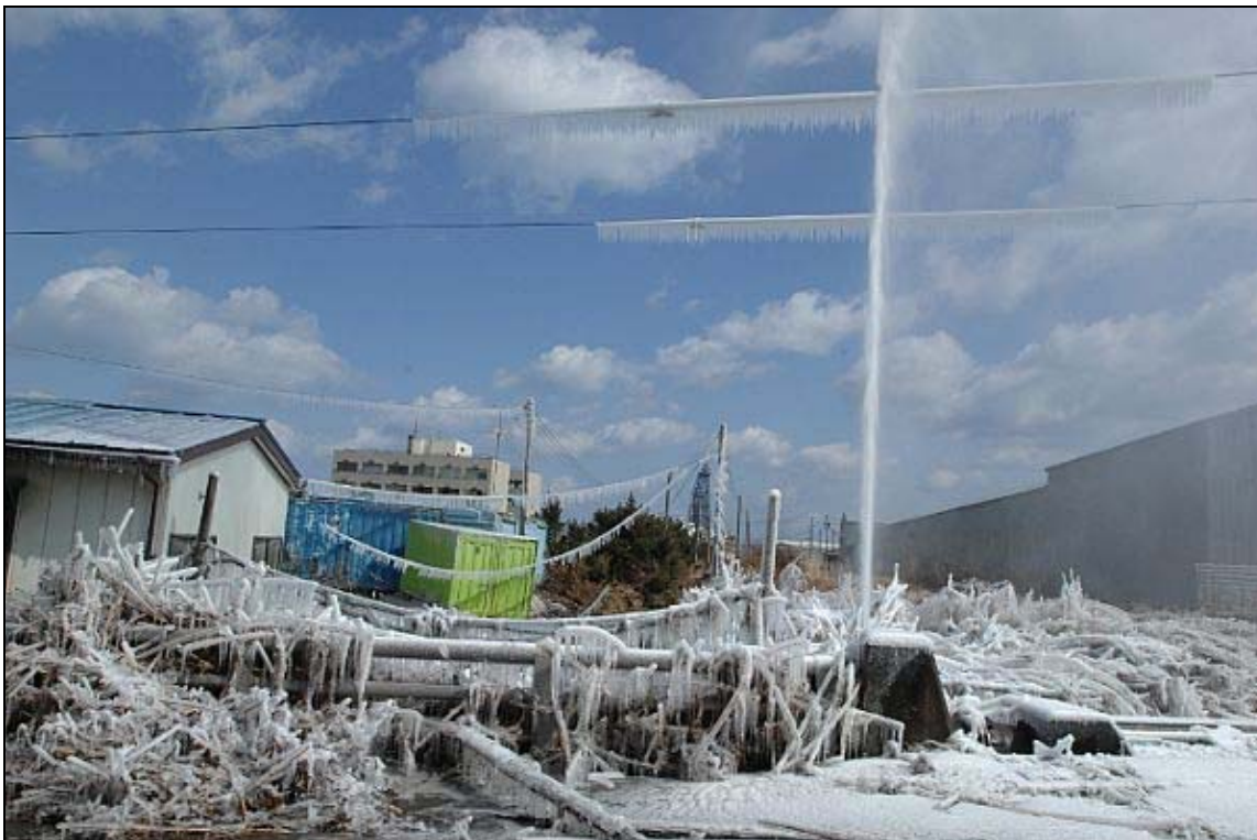
Figure 5.A Damaged Water Pipe Shoots into the Air, Hachinohe, Japan