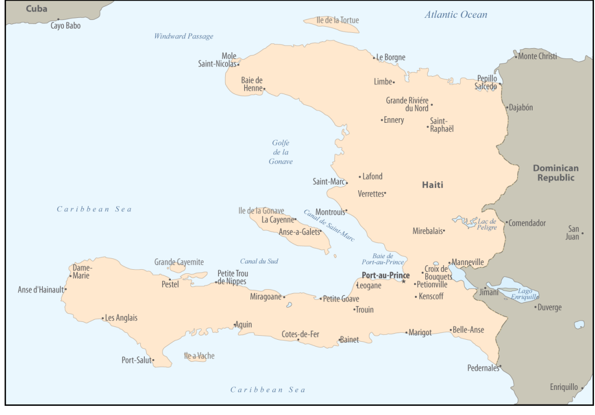
Figure 1. Map of Haiti