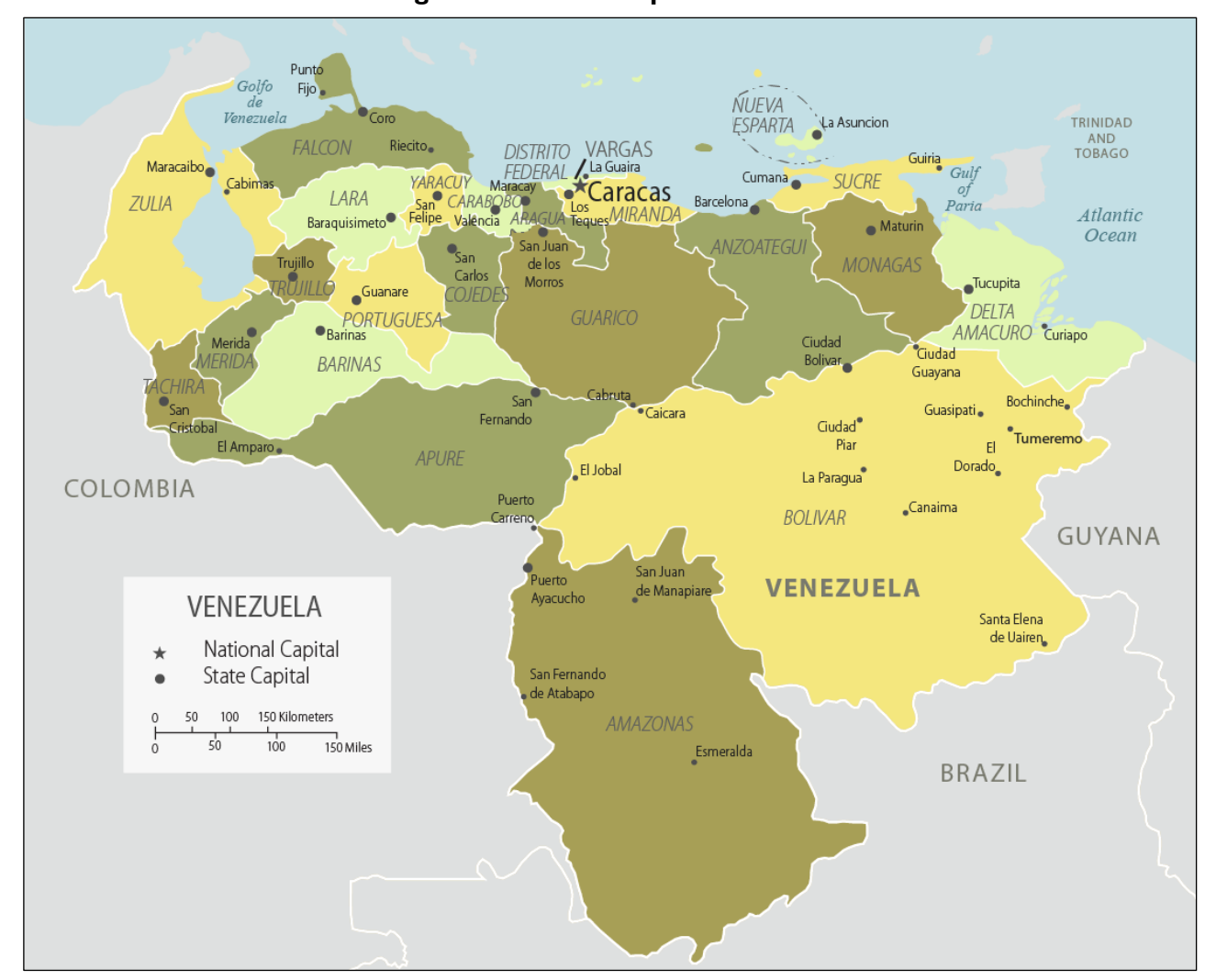
Figure 1. Political Map of Venezuela