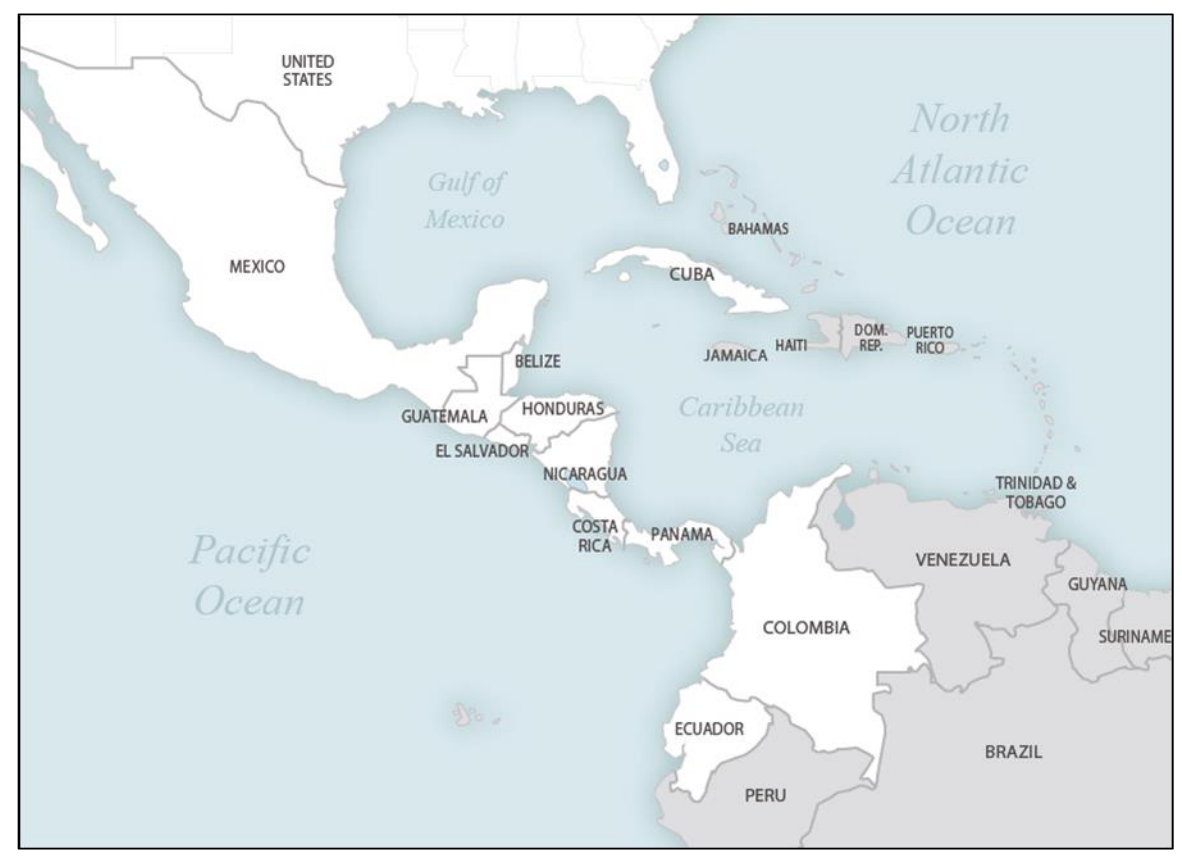
Figure 5. Cuban Migration, from Ecuador to the United States

emigration from Cuba toward the United States." Nicaragua echoed Cuba's position, placing blame for the wave of migration on the United States for its policy that attracts Cuban migrants. 192