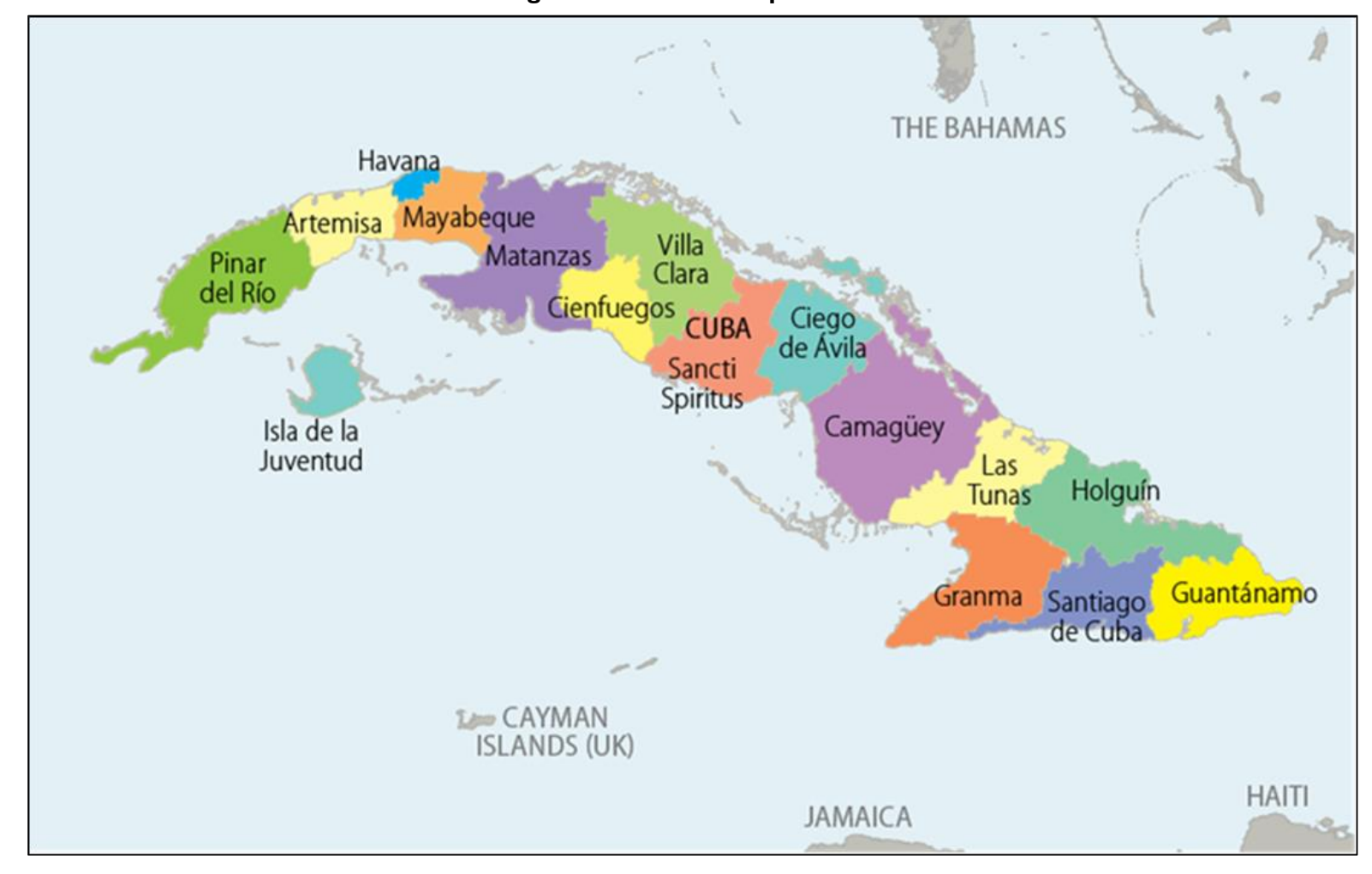
Figure I. Provincial Map of Cuba