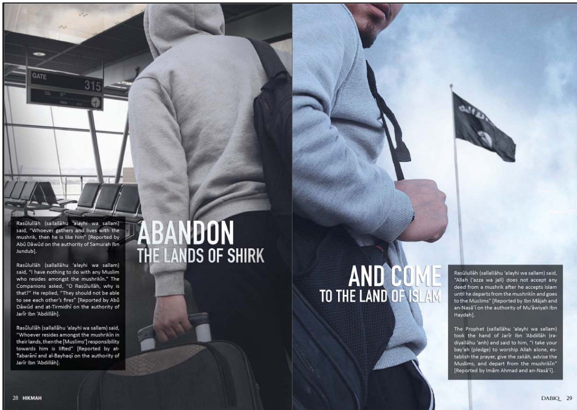
Figure B-2. Islamic State Propaganda Encouraging Foreign Recruits to Travel