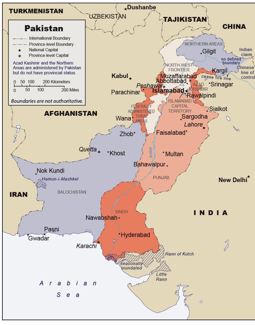
Figure 1. Map of Pakistan