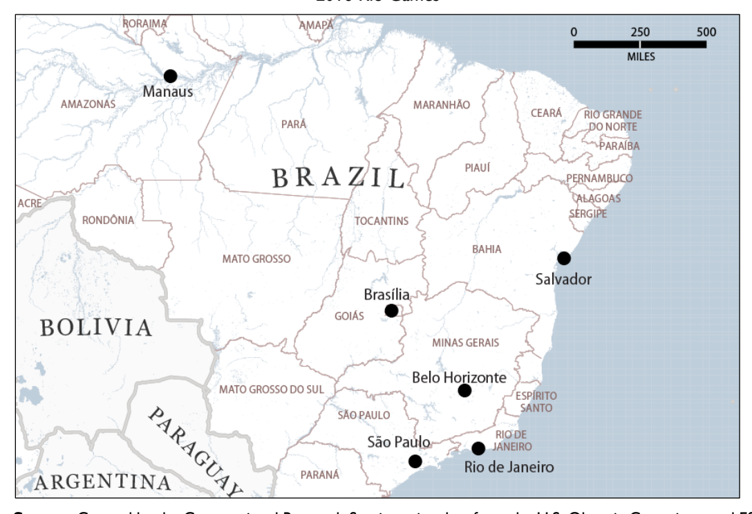
Figure 2. Olympic Venues for Soccer 2016 Rio Games