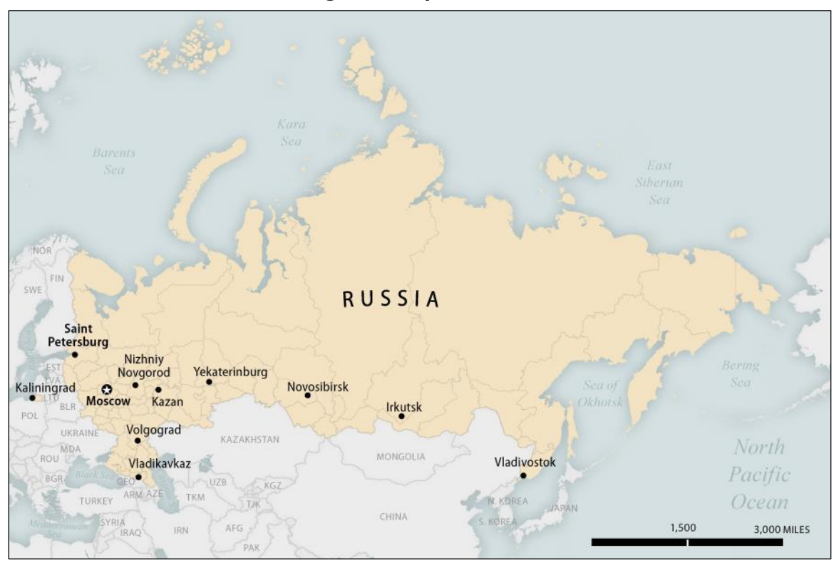
Figure 1. Map of Russia

appellate body. The Constitutional Court rules on the legality and constitutionality of governmental acts and on disputes between branches of government or federative entities. A 2015 law gives the Constitutional Court the legal authority to disregard verdicts by interstate bodies that defend human rights and freedoms, if the court concludes that such verdicts contradict Russia's constitution (although the latter requires compliance of rules established by international treaties over domestic law). A Supreme Commercial Court, which handled commercial disputes and was viewed by experts as relatively impartial, was dissolved in September 2014, with its areas of jurisdiction transferred to the Supreme Court; lower-level commercial courts continue to function.