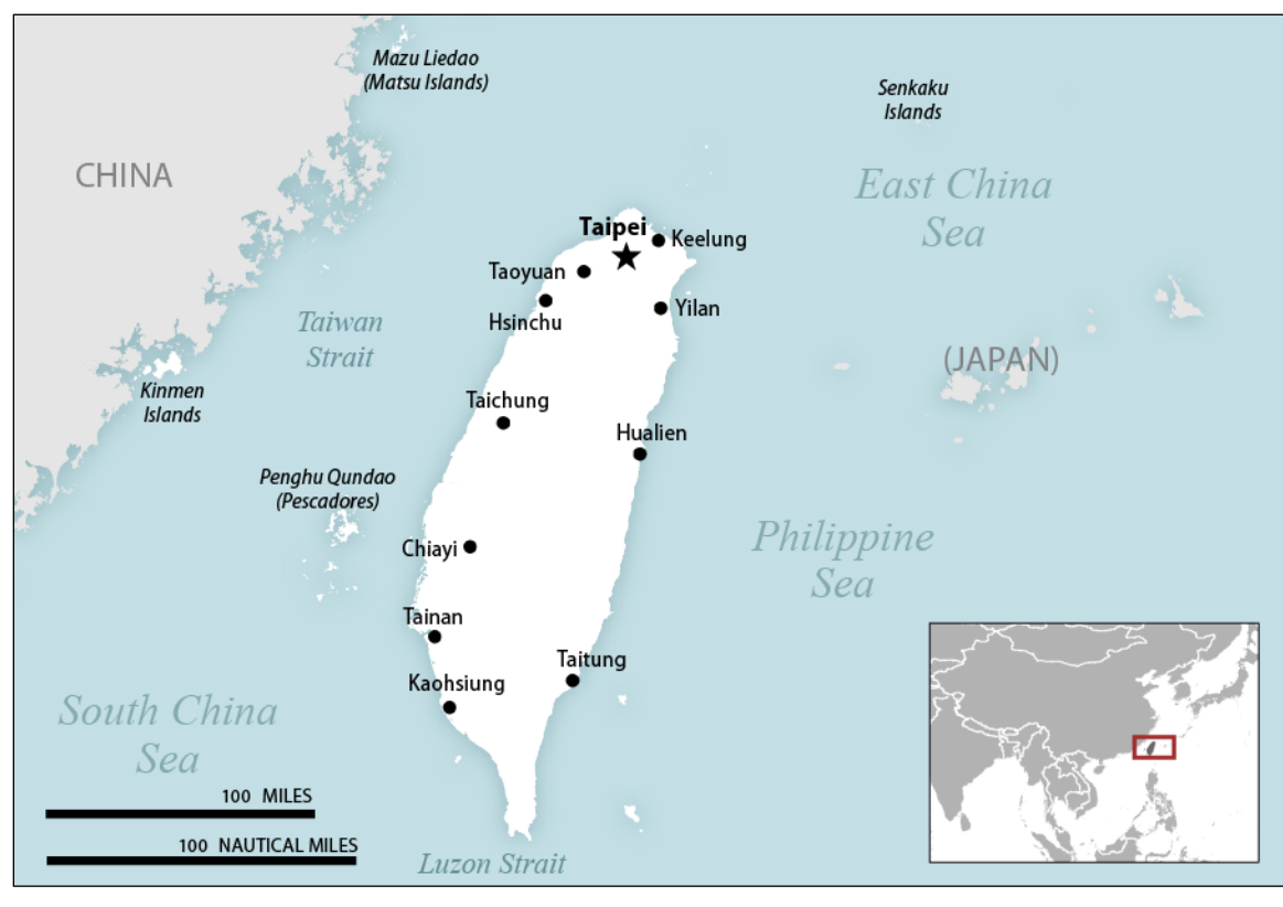
Figure I. Map of Taiwan