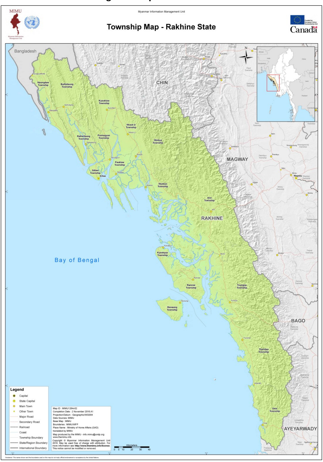
Figure 1. Map of Rakhine State