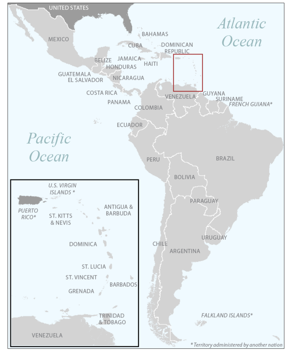
Figure 1. Map of Latin America and the Caribbean