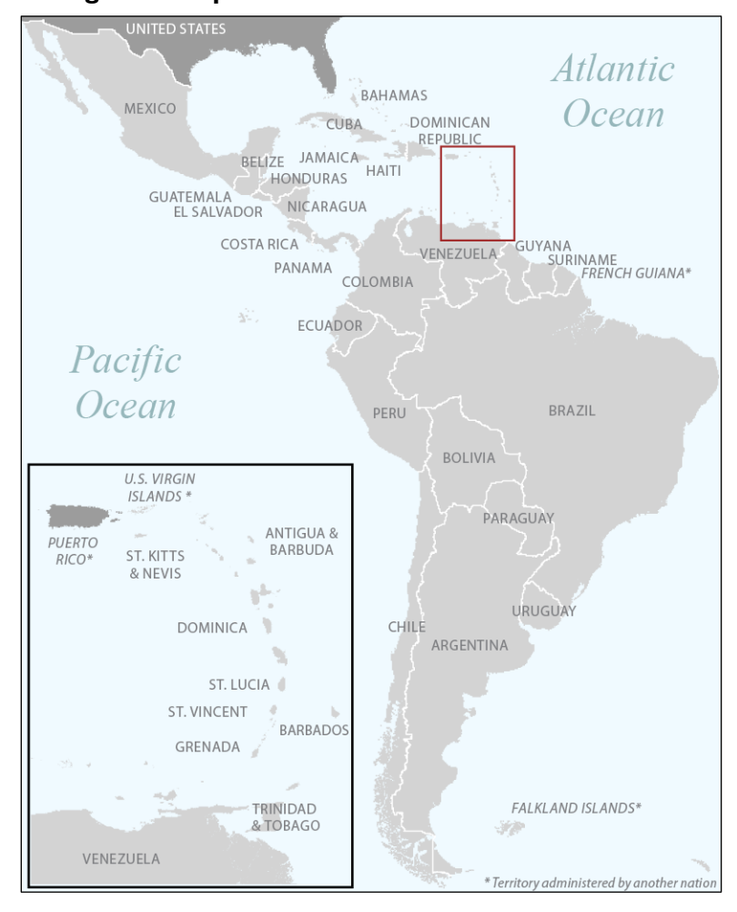
Figure I. Map of Latin America and the Caribbean

Foreign assistance (also referred to as foreign aid in this report) is one of the tools the United States employs to advance U.S. interests and policy goals in Latin America and the Caribbean.<sup>1</sup> The focus and funding levels of aid programs change along with broader U.S. objectives. Current aid programs reflect the diverse needs of the countries in the region, as well as the broad range of these countries' ties to the United States (see Figure 1 for a map of Latin America and the Caribbean). Some countries receive U.S. assistance across many sectors to address political, socioeconomic, and security challenges. Others have made major strides in consolidating democratic governance and improving living conditions; these countries no longer receive traditional U.S. development assistance but typically receive some U.S. support to address shared security challenges, such as transnational crime. Congress authorizes and appropriates foreign assistance funds for Latin America and the Caribbean and conducts oversight of aid programs and the executive branch agencies that administer them.