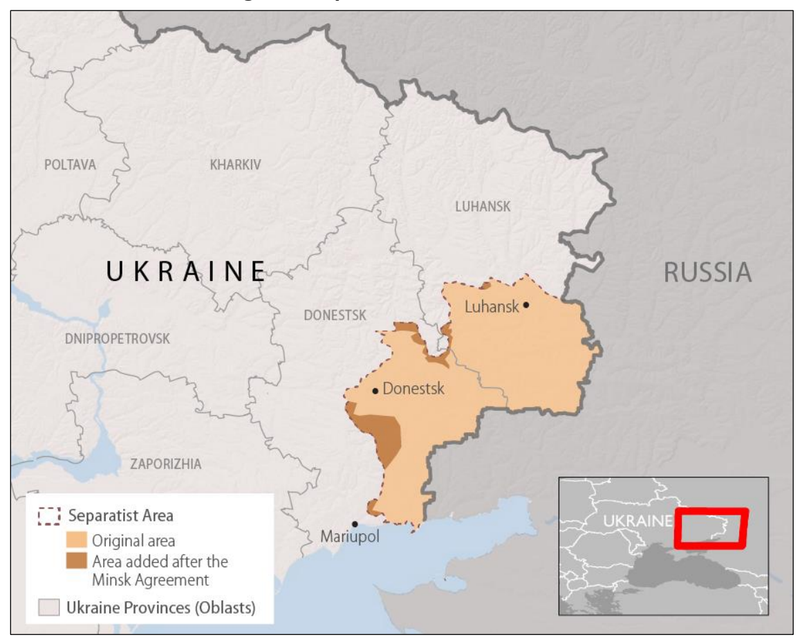
Figure 2. Separatists Areas in Ukraine