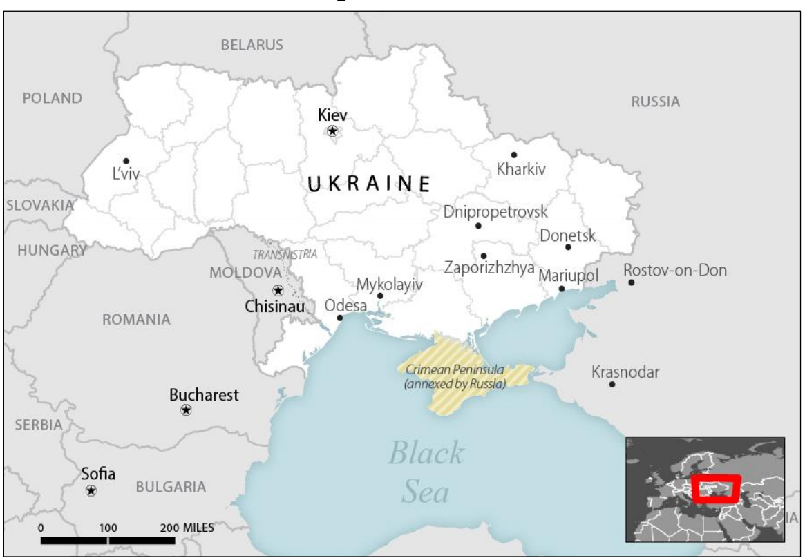
Figure I. Ukraine