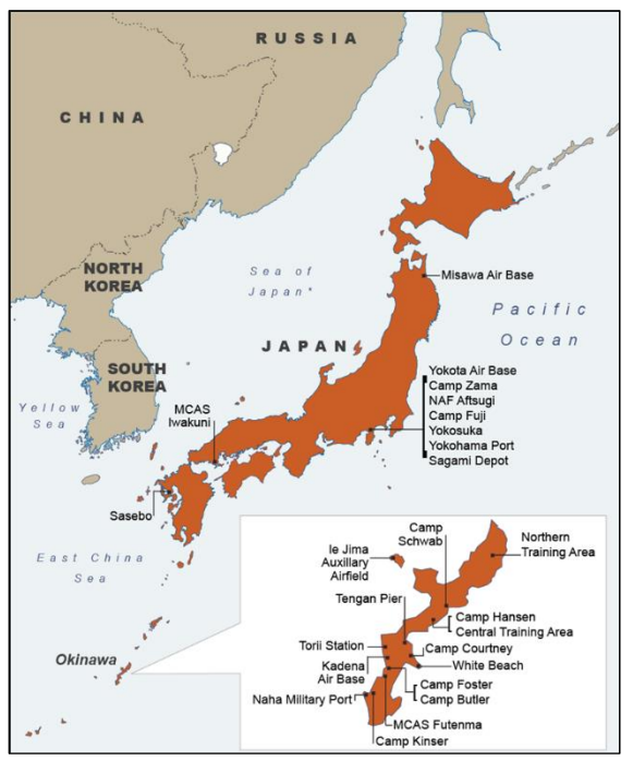
The U.S. Military in Japan: 54,000 troops with the exclusive use of 85 facilities

Japanese Prime Minister Shinzo Abe is a stalwart supporter of the alliance and has had notable success on his ambitious agenda to increase the capability and flexibility of Japan's military. Abe's dominance over Japanese politics since his election in late 2012 has created opportunities for more predictable alliance planning. Although constitutional, legal, fiscal, and political barriers hinder further development of defense cooperation, Japan is steadily expanding its capabilities and, subtly, its attitude toward the use of military force, which is constrained by the Japanese constitution.