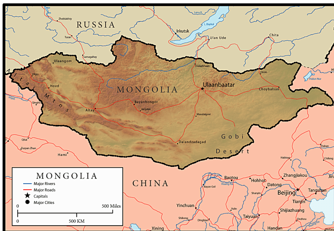
Figure 3. Map of Mongolia

On October 23, 2007, the U.S. and Mongolia signed a memorandum of understanding to increase cooperation in preventing nuclear smuggling by allowing the U.S. to install radiation detection equipment in Mongolia and at several of its border crossings. In addition, the two sides signed the Proliferation Security Initiative Shipboarding Agreement, which would allow either side to request the other to confirm the nationality of a U.S. or Mongolian flagged vessel, and possibly detain the ship or its cargo, in order to prevent the proliferation of weapons of mass destruction (WMD). 26