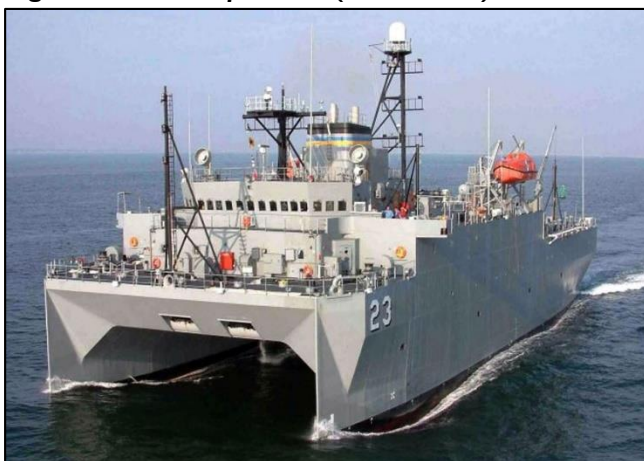
Figure 1. USNS Impeccable (TAGOS-23)