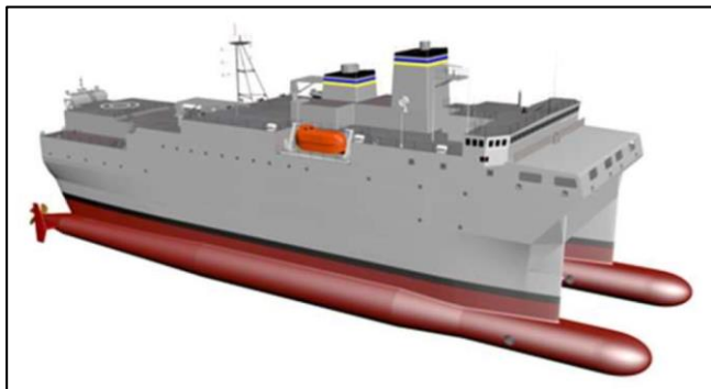
Figure 4. Notional Navy Design for TAGOS(X)