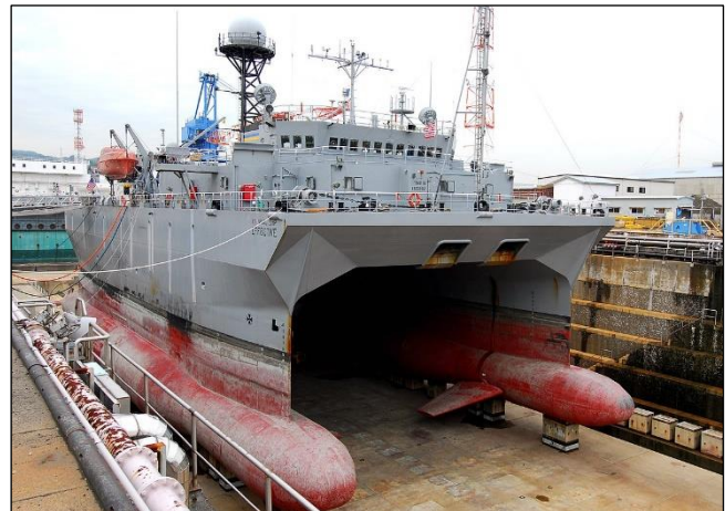
Figure 2. USNS Effective (TAGOS-21) in Dry Dock