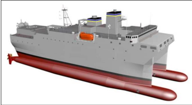
Figure 4. Notional Navy Design for TAGOS-25

Source: Artist’s rendering accompanying press released entitled “Halter Marine Secures Contract for Industrial Studies for T-AGOS Program,” Halter Marine, July 20, 2020.