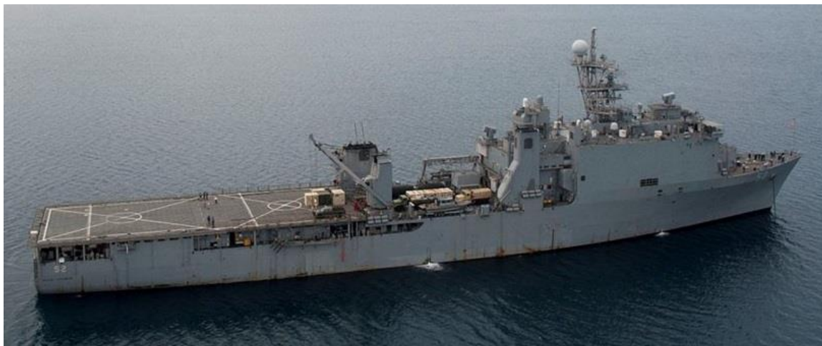
Figure 1. LSD-41/49 Class Ship