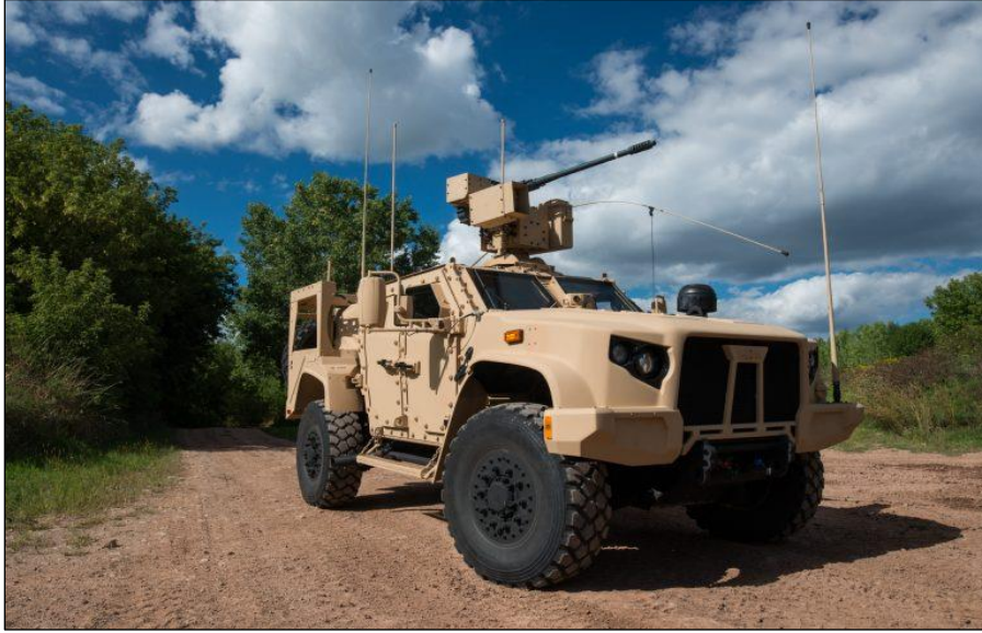
Figure 2. Illustrative LRV