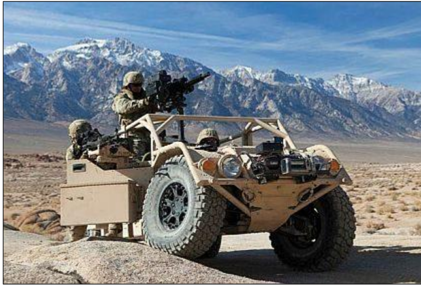
Figure 1. Illustrative GMV/ISV