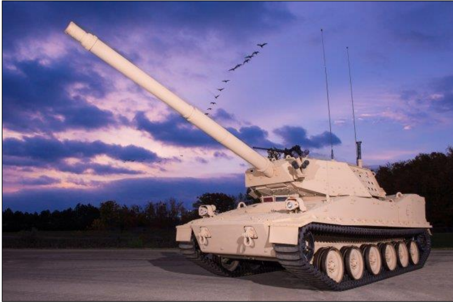
Figure 3. Illustrative MPF