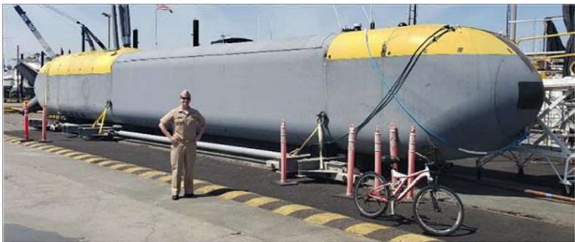
Figure 12. Boeing Echo Voyager UUV