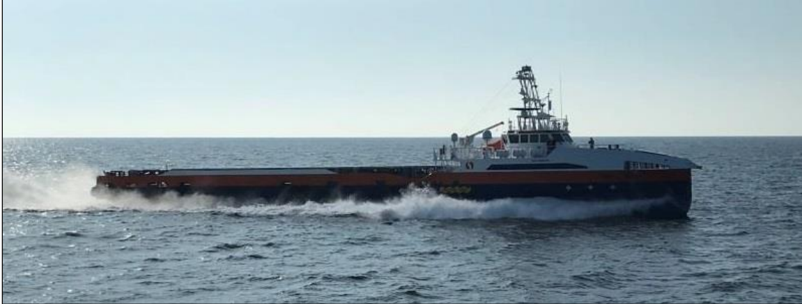
Figure 4. LUSV Prototype

Source: Cropped version of photograph accompanying Mallory Shelbourne, “6 Companies Awarded Contracts to Start Work on Large Unmanned Surface Vehicle,” USNI News , September 4, 2020. The caption to the photograph states in part: “A Ghost Fleet Overlord test vessel takes part in a capstone demonstration during the conclusion of Phase I of the program in September.” The photo is credited to the U.S. Navy.