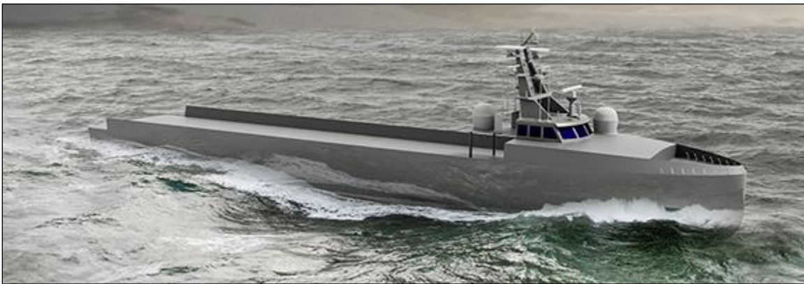
Figure 6. Rendering of L3Harris Design Concept for MUSV