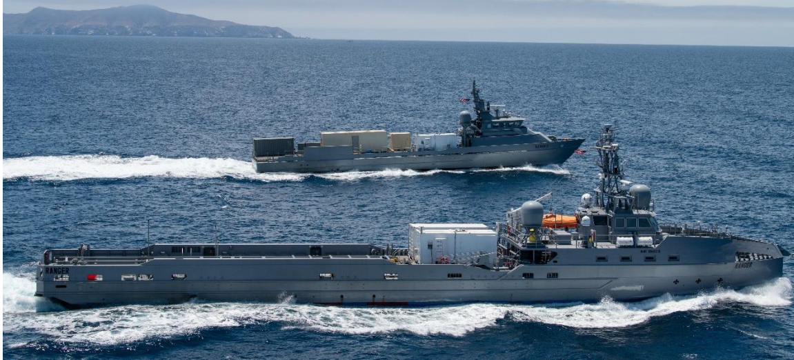
Figure 3. USV Prototypes

The briefing slide states that the photograph shows “Overlord USVs Ranger & Nomad on the West Coast.”