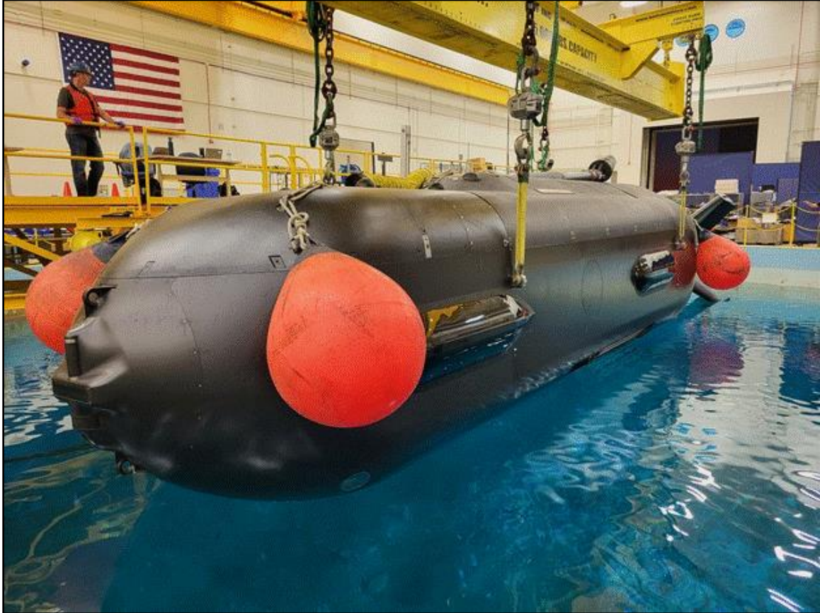
Figure 7. XLUUV (Orca)