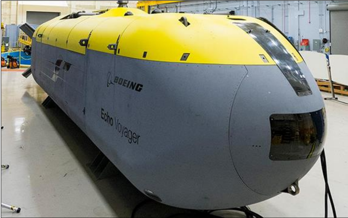
Figure 10. Boeing Echo Voyager UUV