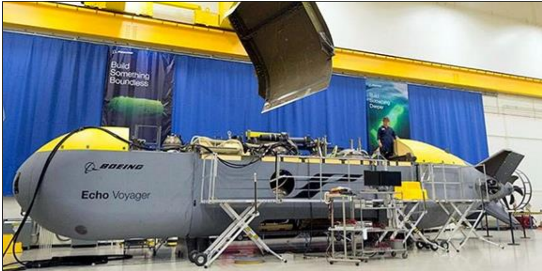
Figure 11. Boeing Echo Voyager UUV