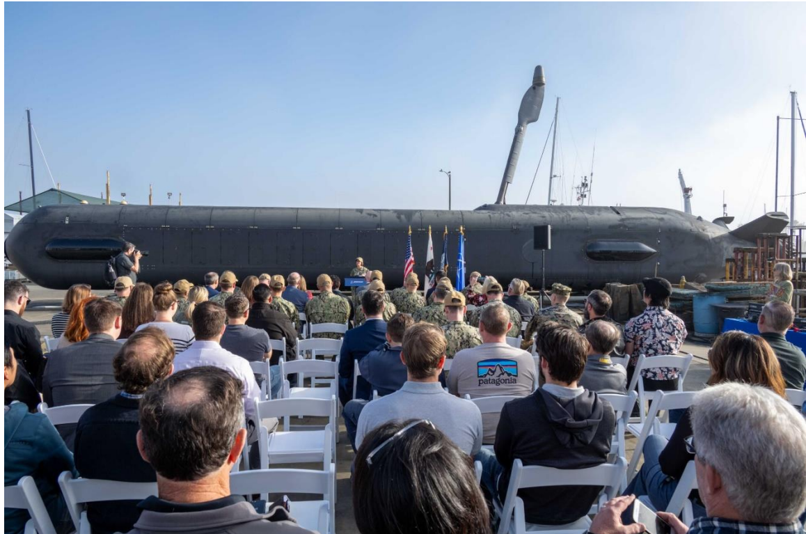
Figure 9. XLUUV (Orca)