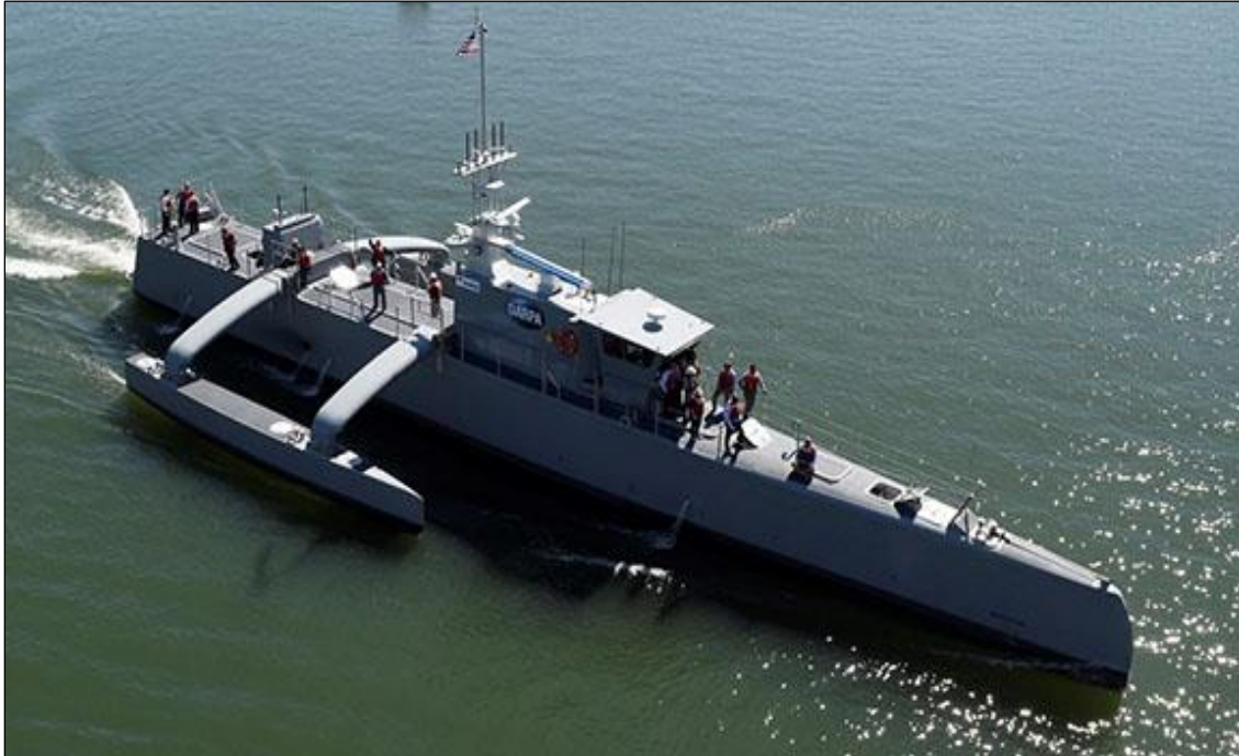
Figure 2. Sea Hunter Prototype Medium Displacement USV