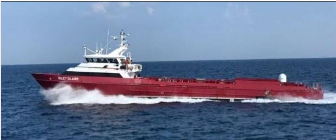
Figure 5. LUSV Prototype

Source: Cropped version of photograph accompanying Mallory Shelbourne, “6 Companies Awarded Contracts to Start Work on Large Unmanned Surface Vehicle,” USNI News , September 4, 2020. The caption to the photograph states in part: “A Ghost Fleet Overlord test vessel takes part in a capstone demonstration during the conclusion of Phase I of the program in September.” The photo is credited to the U.S. Navy.