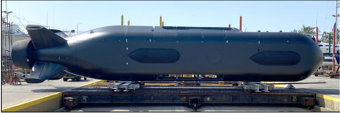
Figure 8. XLUUV (Orca)