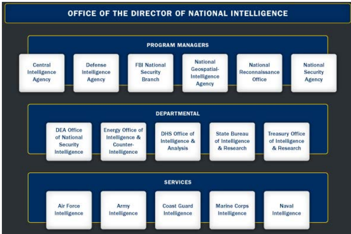
Figure 1. Structure of the Intelligence Community.

Source: Intelligence Community, “About the Intelligence Community: Seventeen Agencies and Organizations United Under One Goal,” http://www.intelligence.gov/about-the-intelligence-community/ (accessed 20 January 2010).