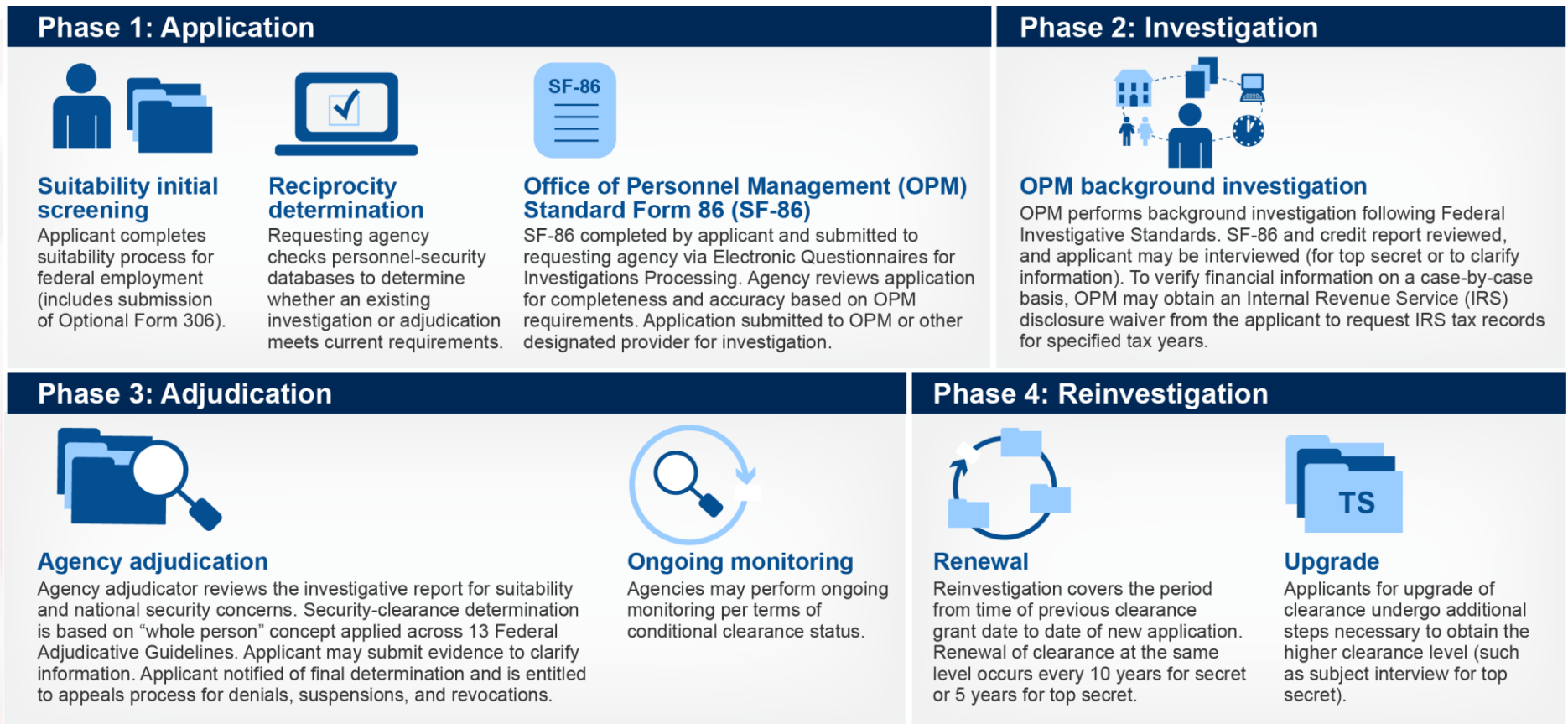
Figure 1: Security Clearance Process

As shown in figure 1, to ensure the trustworthiness and reliability of personnel in positions with access to classified information, government agencies rely on a personnel security clearance process that includes multiple phases: the initial application, investigation, adjudication, and reinvestigation (where applicable, for renewal or upgrade of an existing clearance).