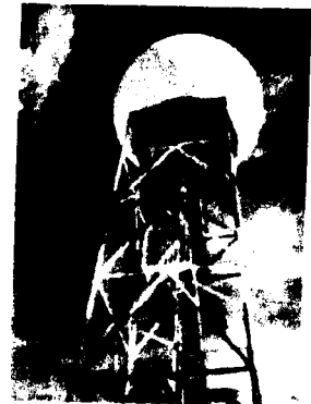
Figure 6: (U) Air Traffic Control Radar