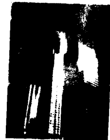
Figure 2: (U) Library Tower

— (U//FOUO) In May 2003, reports linked al-Qa'ida to a plan to fly an explosives-laden general aviation aircraft into the U.S. Consulate in Karachi, Pakistan. 6,7