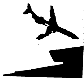
Figure 3: (U) PSWA Flight 182