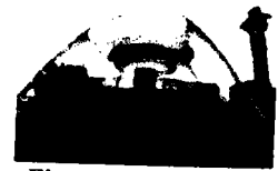
Figure 1: (U) LAX

— (U//FOUO) In 2002, al-Qa'ida planned a suicide hijacking to attack the U.S. Bank Tower/Library Tower in Los Angeles. 3