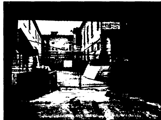
A key building, in which nuclear materials are used, at the Kurchatov Institute before recent efforts by the US and Russia Lab-to-Lab program to improve nuclear materials control at the facility.

Working together with the Russians on problems of common interest and concern is the key to the success of this program.