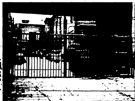
A few months later, the same building at Kurchatov is surrounded by a fence equipped with intrusion sensors and sophisticated entry and exit control equipment.

February 1995: Demonstration of MPC&A system capabilities to a wide audience of Russian and US participants.