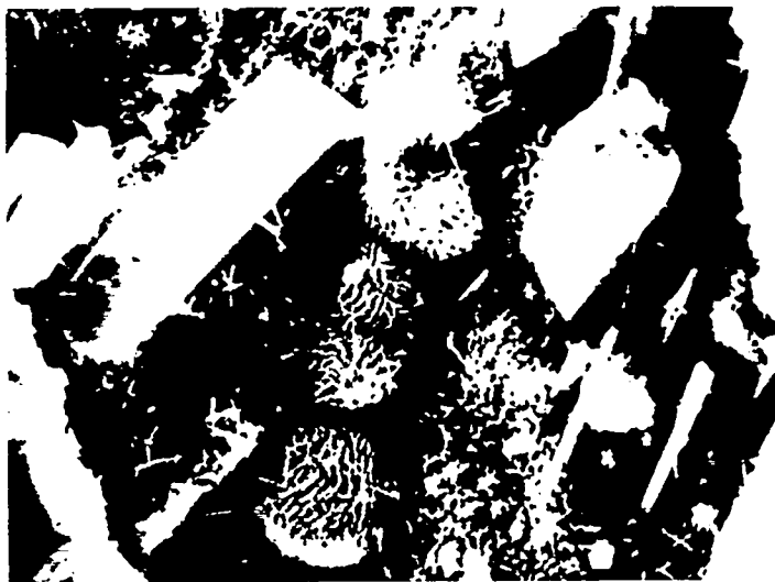
Scanning electron micrograph of a sample taken from 1,666-ft depth in the altered Topopah Spring basal vitrophyre. The photo reveals spherical smectite aggregates and tubular heulandite crystals.

The results of these studies, combined with the hydrogeological model of Yucca Mountain provided by the USGS