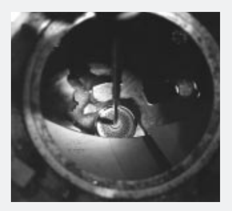
The last bit of extract containing the unstable germanium is drawn out from the gallium tank. The extract appears as a silvery pool floating on top of the duller, liquid gallium metal.

(a) SAGE has three distinct stages of operation: the transmutation of <sup>71</sup>Ga into unstable <sup>71</sup>Ge caused by solar neutrinos, the chemical extraction of the <sup>71</sup>Ge atoms, and the detection of the <sup>71</sup>Ge decays. The number of decays is proportional to the solar-neutrino flux. (b) Because of low-lying excited states in the <sup>71</sup>Ge nucleus, the inverse-betadecay reaction of gallium into germanium has a threshold of only 0.233 MeV. The reaction is therefore sensitive to pp and all other solar neutrinos. The energetic neutrinos leave the <sup>71</sup>Ge in an excited state, which quickly decays to the ground state. (c) After an 11.4-day half-life, <sup>71</sup>Ge decays by capturing an orbital electron. The remaining electrons quickly reconfigure themselves around the new nucleus and dissipate excess energy by emitting x-rays and/or Auger electrons. These emissions are the signature of the decay.