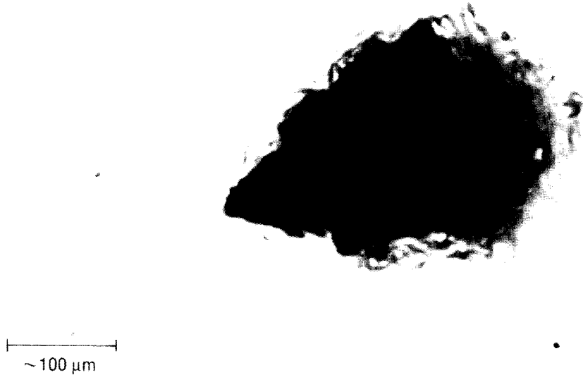
Fig. 1. Cells in culture multiply by mitosis and spread over the surface of the culture dish until a confluent monolayer of cells is formed. Shown here is an optical micrograph of a confluent monolayer of fibroblasts cultured from a piece of human skin tissue (dark area).