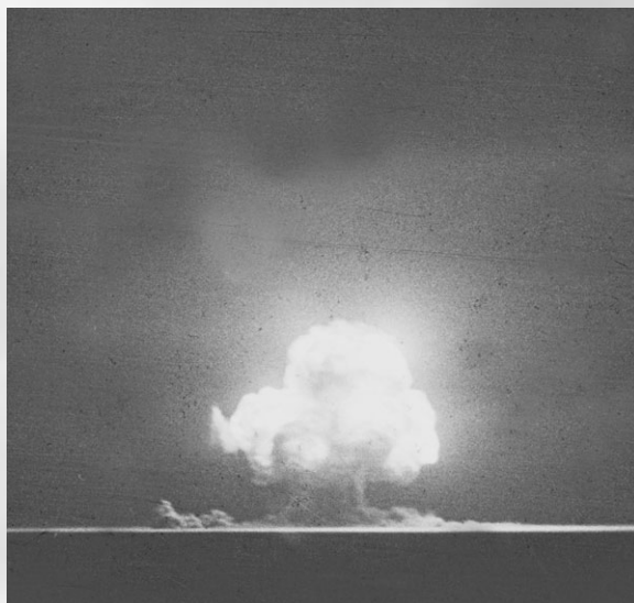
The fireball at Trinity site.

What would history be like if the bombs were not ready or if the United States refrained from using them? The bloody battle of Okinawa was a foretelling. The War Department estimated that, in the planned October invasion of the mainland, there would be a quarter of a million U.S. casualties and perhaps one to two million