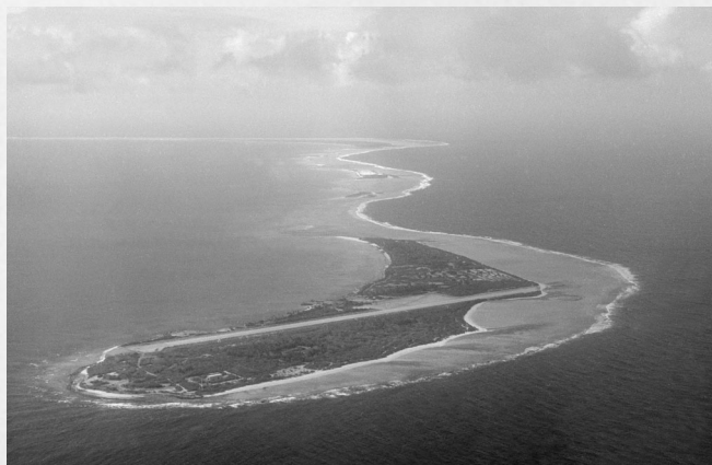
View of the Enyu Island in the Bikini Atoll.

Nuclear testing became a political, as well as a scientific, enterprise. International treaties regulated testing. International motivations resulted in test moratoriums, mutual or unilateral, and in the ending of such moratoriums. Nor was the number of tests or the nature of the tests free from political considerations. When the Soviet Union broke the moratorium in 1961, the United States responded by