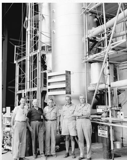
The Mike device is pictured just before it demonstrates the new thermonuclear concept.

Why was there interest among the military and the Los Alamos scientists in a weapon that would produce a yield of 1, 10, or even 100 megatons? The Trinity bomb was 20 kilotons in yield; it obliterated a city and