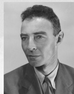
J. Robert Oppenheimer

By 1941, Fermi was already building a nuclear reactor pile in the basement of Pupin, the physics building at Columbia University. That pile could not achieve criticality because of the neutron-absorbing impurities in the graphite blocks then available. Fermi was the most complete physicist of the brothers, perhaps the most complete physicist of the century. He had a profound understanding of his subject. In theoretical physics, quantum mechanics was as natural to him as classical mechanics. He said that,