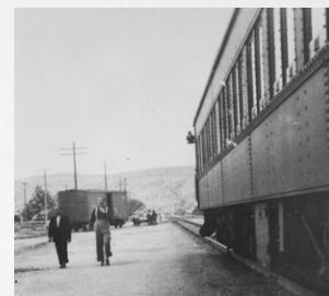
Newly hired Los Alamos staff arrived at Lamy, New Mexico.

part of the medical lexicon and one not always appreciated by a husband mired in a resistant technical analysis. People were sometimes under stress, and release by drinking was a common indulgence. Although alcohol was off-limits on a military base, that was no barrier to the ingenuity of the staff. It was reliably reported that one