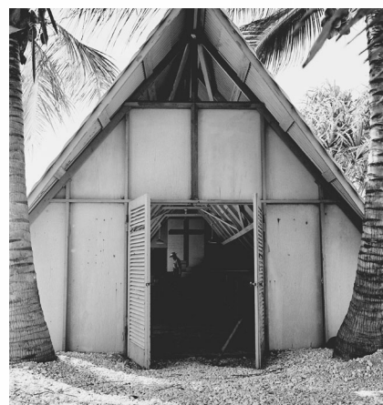
This chapel was built for the people involved in the tests on Parry Island (now known as Medren Island) in the Enewetak Atoll.

From the atoll rim, the water bottom, which is the edge of the sea mound, falls rapidly away to the sea floor, 5 kilometers below. The slope is about 20 degrees. As a result, the low-tide boundary is sharp, indented by