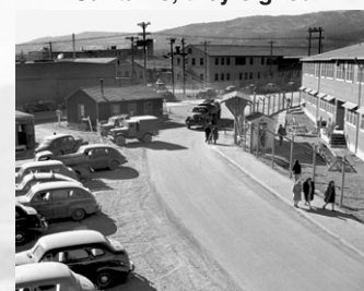
Once at the tech area in Los Alamos, they spent long hours applying the new concepts of nuclear physics to a usable weapon.