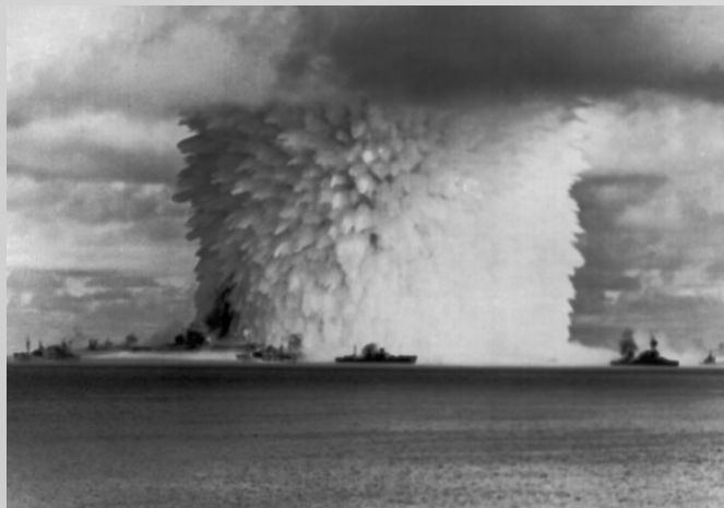
In 1946, two implosion bombs, identical to the one tested at Trinity site and the one that had destroyed Nagasaki, were tested as part of Operation Crossroads in the Pacific.

with all three visiting luminaries, Bethe, Teller, and Fermi.