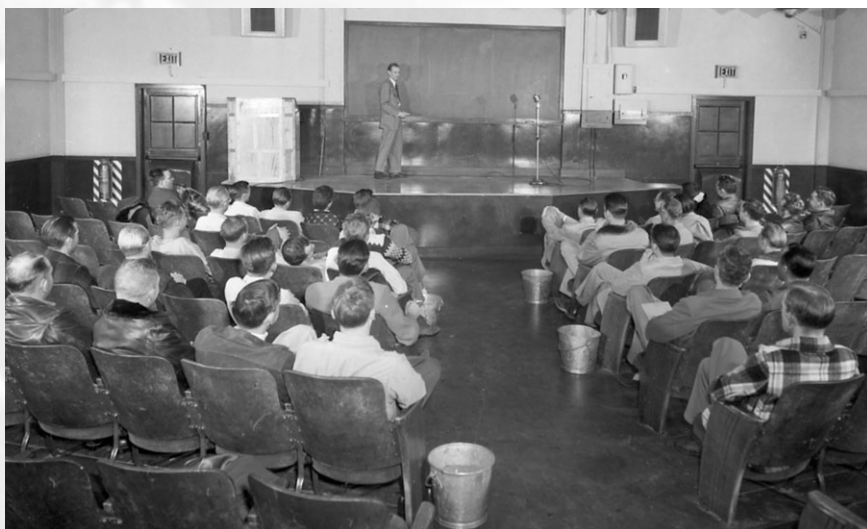
At the Laboratory, the hours were long, and the work hard. The weekly colloquia, one of which is shown in this photo, were stimulating and intense. They are still remembered.

When Los Alamos was founded in April 1943, fission bombs were already known to be feasible, at least in principle. Two avenues to their production were using the separated uranium-235 isotope to be produced by Oak Ridge or using plutonium-239 to