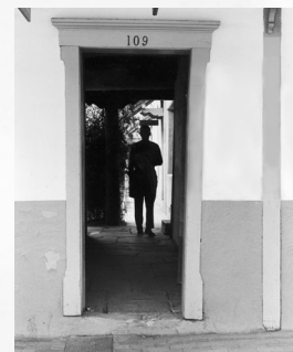
At 109 Palace Avenue in Santa Fe, they signed in.