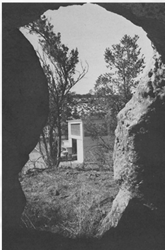
The building in which criticality experiments were carried out was called the kiva, a term borrowed from the Pueblo Indians. Here, the kiva is photographed from an Indian cave in the nearby wall of the Pajarito Canyon.

But the scientists were on familiar ground. In their research, as usual, nature was in charge, but not always clear and apparent in her direction. In keeping with their background, the scientists organized in traditional academic manner, by topical disciplines. They created divisions in physics, chemistry, explosives, mathematics