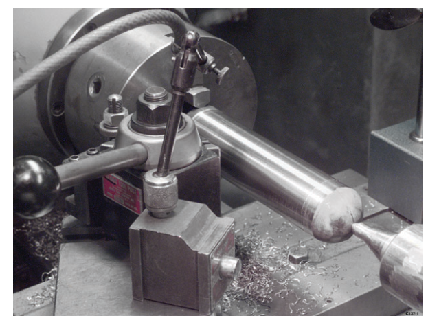
Figure 2. The Dry Machining Process (a) The new dry machining process avoids heavy use of lubricants, which are expensive and difficult to dispose of when becoming waste. In this process, no chemical changes take place on the surface of the plutonium parts, and thus all the plutonium shavings can be collected for reuse. The dry machining process, therefore, generates no plutonium waste. (b) Star machinist Dean Martinez is programming the T-base lathe to machine a component.