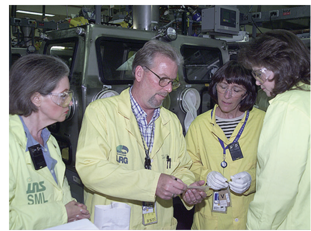
Figure 4. Quality Assurance Audit Los Alamos and National Nuclear Security Administration quality specialists verify that quality assurance systems support pit manufacturing.

tions back up, we built two standard pits whose status we compared with that achieved for the last fabricated pit. Although the quality control and assurance systems had matured greatly during the restructuring activities, the long period of inactivity had, as expected, some negative effects on both the equipment and the process operators. Even after the second pit was fabricated, not all the processing